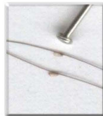
Attached nits enlarged